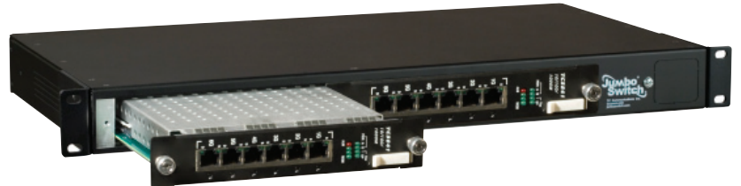
TCRM199i - holds 2 Interface Cards