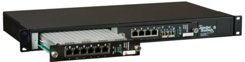
TCRM199 - holds 1 Main/MGMT Combo and 1 Interface Card