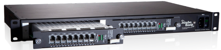
2x TC8624 in 1U Chassis (Front)