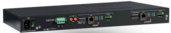
2x TC8624 in 1U Chassis (Rear)

As shown 2x TC8624 as 16-Ch 600 ohm Analog & Dry Contact over T1/E1 Multiplexer