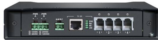
TC8610B Rear Panel

The TC8610B is a 2 Channel Serial-over-T1/E1 multiplexer with built-in power redundancy.