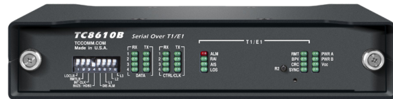
TC8610B Front Panel