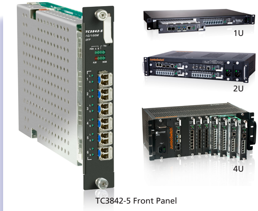
TC3842-5 Front Panel

F eaturing a wide range of advanced networking features, the TC3842-5 is a 6-Port 100M/1G SFP Ethernet Expansion card. It is compatible with both SFP optical and copper modules supports 850nm multimode and 1300/1550 single mode for distances up to 100km, and is available with a “one fiber, bi-directional” option to maximize fiber optic cable usage. As member of the JumboSwitch® family, this card increases the number of Ethernet ports of the chassis and expands the advanced network features which include: