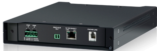
TC1910S Standalone Unit Rear

The TC1910 Ethernet Telephone/Analog Extender enables telephone service over a LAN via 10/100 Base-T Ethernet connections. It has a built-in Codec that digitizes voice and converts to packets for transmission between local and remote TC1910s with designated IP addresses. It is compatible with PBX and Key Systems (POTS).