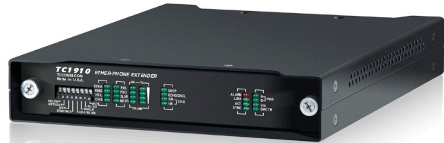
TC1910S Standalone Unit Front