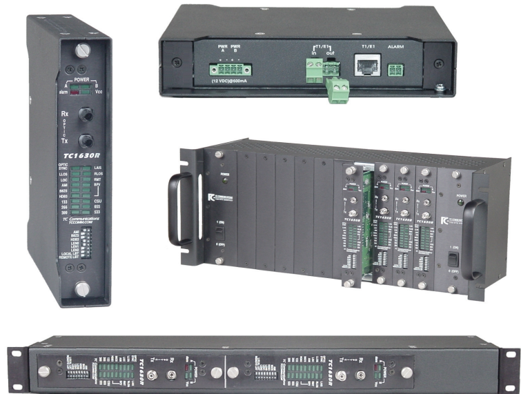
TC1630R/S in Standalone and Rackmount Packaging

The TC1630R/S T1/E1 Fiber Optic Modem provides a highly reliable point-to-point link between two T1/E1 devices and is available in both multimode and single mode (850/1300/1550nm) versions.