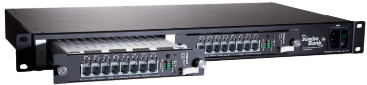
2x TC8634 in 1U Chassis (Front)