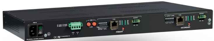
2x TC8634 in 1U Chassis (Rear)

The TC8634 is a 4-channel 600 Ohm Analog & Dry Contact-over-T1/E1 Multiplexer. Two TC8634 cards can be combined to form an 8-channel 600 Ohm Analog & Dry Contact unit that utilize a single T1/E1 line or provide T1/E1 line redundancy. It allows network managers the flexibility of leveraging their existing T1/E1 circuits by adding low cost analog or dry contact links as needed. It is economical, simple to install and comes standard with built-in power redundancy.