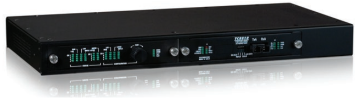
TC8510P 19" Wide, 1U High Rackmount Version

The TC8510 Ethernet & T1/E1 Fiber Multiplexer provides 10/100 Ethernet and T1/E1 Connectivity. It multiplexes various combinations of one-to-four T1/E1 or Serial Data channels and a 10/100M Ethernet over single mode (1300/1550nm) or multimode fiber (1300/1550nm).