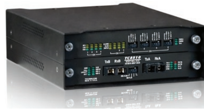
TC8510S Standalone/Wallmount Version