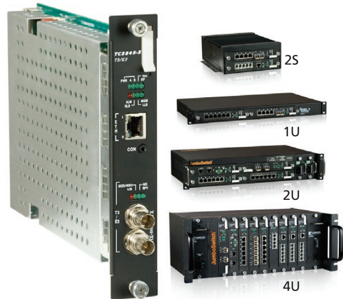
TC3845 - T3/E3-over-IP Gateway

Featuring extremely low latency, the TC3845-3 T3/E3-over-IP Gateway transports T3/E3 over Layer 2/3 Ethernet/IP networks. It is simple to configure and supports point-to-point topologies.