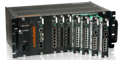
Management for the JumboSwitch® Chassis