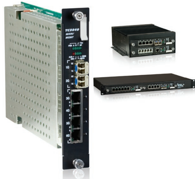
JumboSwitch "Combo Card" for the 2S & 1U Chassis

In addition to the deal for small chassis options (1U & 2S), the JumboSwitch Main/Management "Combo" Card, Model TC3840-3, provides layer 2 switching functionalities and is the central switching fabric for JumboSwitch Interface cards. The TC3840-3 offers 4 x 10/100/1000 Copper Ports and 2 x SFP Gigabit Ports for connecting up and down nodes to form a fiber/copper ring or bus topology.