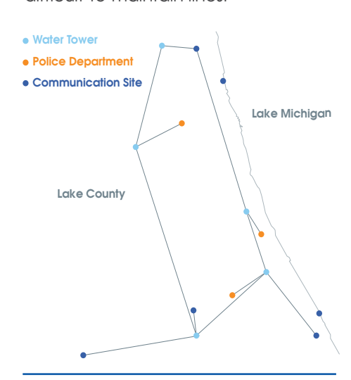
Above: ESRN replaced their leased lines with 4 and 2 wire cards. They integrated PTP 650 radios, a 4.9 GHz public safety network, and an OSPF network.

East Shore Radio Network (ESRN), located near Chicago, needed a replacement solution for its TELCO leased lines to combat rising usage costs that had reached $84,000/year. What's more, support for the leased copper circuits had dwindled as telephone companies phased out the difficult-to-maintain lines.