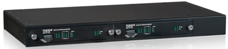
TC8928R (Housed in TCRM195 19" Rackmount Card Cage)

Intended for public safety and SCADA communications applications, the new TC8928 Analog Broadcaster/Bridge from TC Communications receives a single 4-wire 600 ohm analog signal and broadcasts it to up to 7 remote analog lines. It can be used in conjunction with the TC3846-6 Analog IP Gateway to broadcast over Ethernet networks.