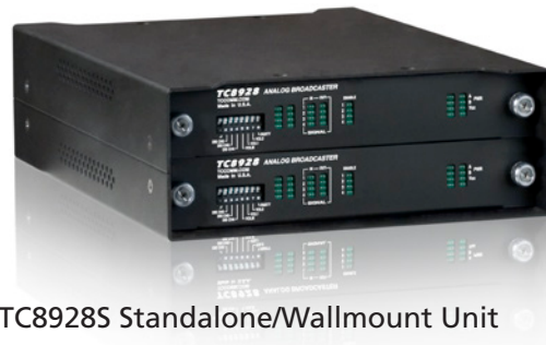
TC8928S Standalone/Wallmount Unit