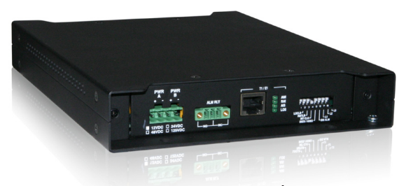
TC8614S Rear Panel

The TC8614 is a 4-channel 600\Omega Analog & Dry Contact-over-T1/E1 Multiplexer that allows network managers the flexibility of leveraging their existing T1/E1 circuits by adding low cost analog or dry contact links as needed. It is economical, simple to install and comes standard with built-in power redundancy.