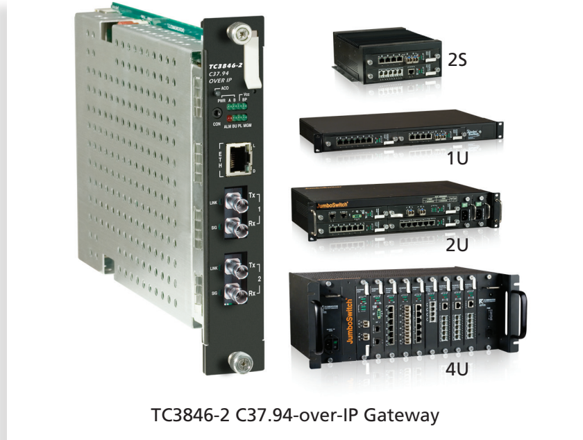
TC3846-2 C37.94-over-IP Gateway

The TC3846-2 links or extends up to 2 channels of C37.94 circuits across Layer 2/3 Ethernet/IP, CE, or MPLS networks. It is easy to configure, offers extremely low latency, and supports point-to-point and point-to-multipoint topologies.