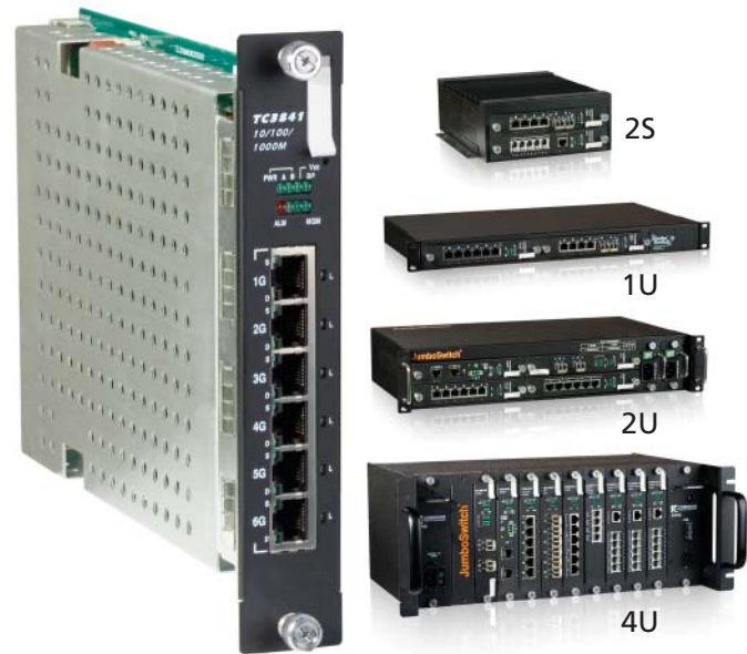
TC3841 with Various JumboSwitch Chassis & Card Cages

Featuring a wide range of advanced networking features, the TC3841 is a 6-Port Gigabit (10/100/1000M) Copper Ethernet Switch. It can also be configured as a 6-Port 10/100 Ethernet Switch as an option.