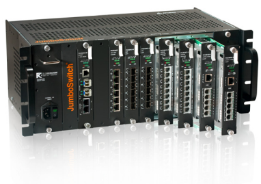
Management for the JumboSwitch® Chassis